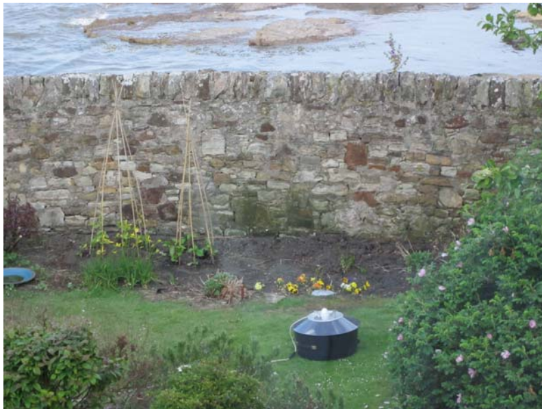
Our garden June 2010

We started with a 6w actinic Heath trap, which I now keep in the campervan for when we are on tour, and in 2000 we invested in a Robinson 125w, which greatly increased the volume of moths attracted to the light. However, following recent discussion on the Yahoo group I might bring the Heath trap out over the winter to see if, as suggested, the less bright light is better at attracting the hardy moths which supposedly are on the wing at this time of year. That would make a welcome change from the nil catch over the winter months last year.