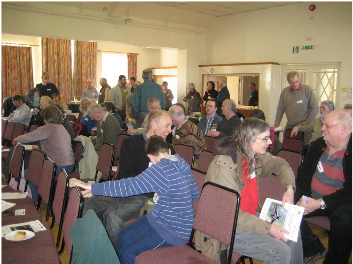
A busy room at last year's 2010 GMS AGM in Herefordshire