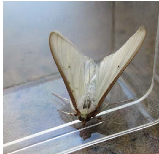
Palpita vitrealis trapped 10/9/2010

The best moth of the year for us was undoubtedly a lovely Palpita vitrealis , which turned up on the night of 10/9/10 as part of the haul for that GMS night. It is not on the GMS Scottish list, and we got very exciting reading Goater and Manley, who both call it a scarce migrant from southern Europe, while the UKMoths website has it down as an immigrant appearing most often in the south and south-west of England. It turned out not to be a first for Scotland, but it was certainly a first for Fife.