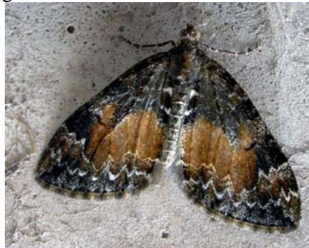
Red-Green Carpet Chloroclysta siterata Common Marbled Carpet C. truncate