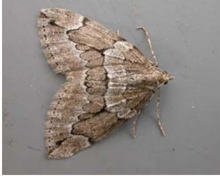
Grey Pine Carpet Thera obeliscata

Conversely, the recording rate of both Common and Smoky Wainscot were greater in 2010 (2.7 and 3.9 times respectively) compared to 2009. Interesting, but as always it is better to leave the statistics to the experts and it will be interesting to see what the national statistics tell us.